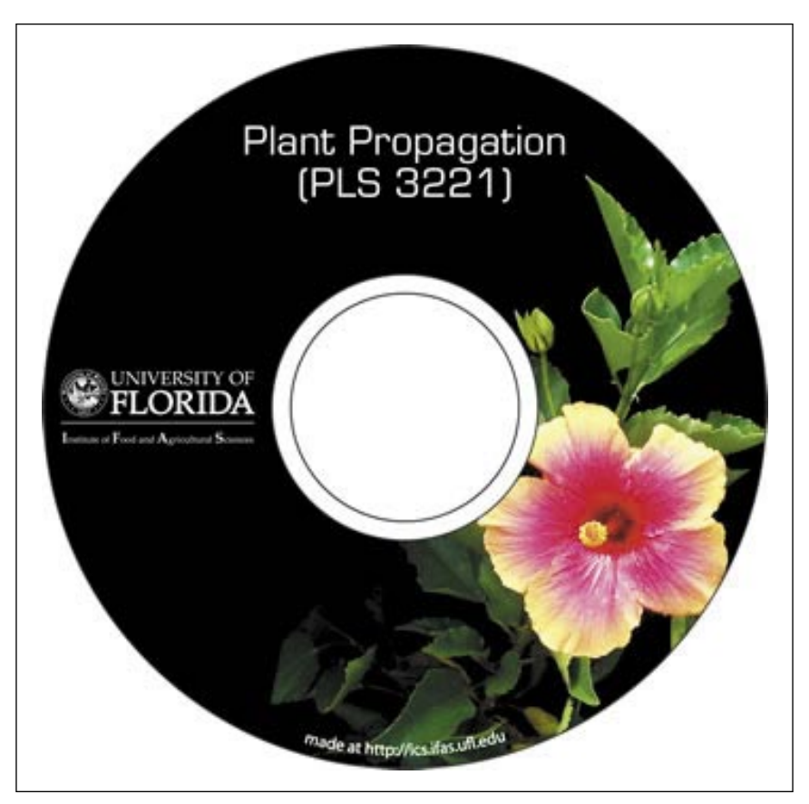
Figure 2. Compact disc developed for the delivery of streaming video lectures, lecture notes, nursery tours, and the plant life cycle animation to supplement videoconferenced lectures for statewide delivery of Plant Propagation.

Coordination of a Plant Propagation Laboratory at Multiple Sites. The teaching team recognized that the independent plant propagation lab courses could benefit from coordination of the laboratory exercise content. While members of the teaching team had previously developed and taught laboratory sections of plant propagation, the addition of new sites with various levels of facility, equipment, and materials availability could be a disadvantage to developing a cohesive statewide laboratory course. The coordinator of the plant propagation teaching team, through input from the plant propagation teaching faculty, facilitated the development of a list of common laboratory topics or concepts, and sequence of delivery to compliment the six course modules. The idea was for the individual lab instructors to retain responsible for the development of site-specific laboratory exercises and activities based on the equipment, materials, and plant species available at a given site. Additionally, laboratory examinations are developed, administered, graded, recorded, and reported by the lab instructor.